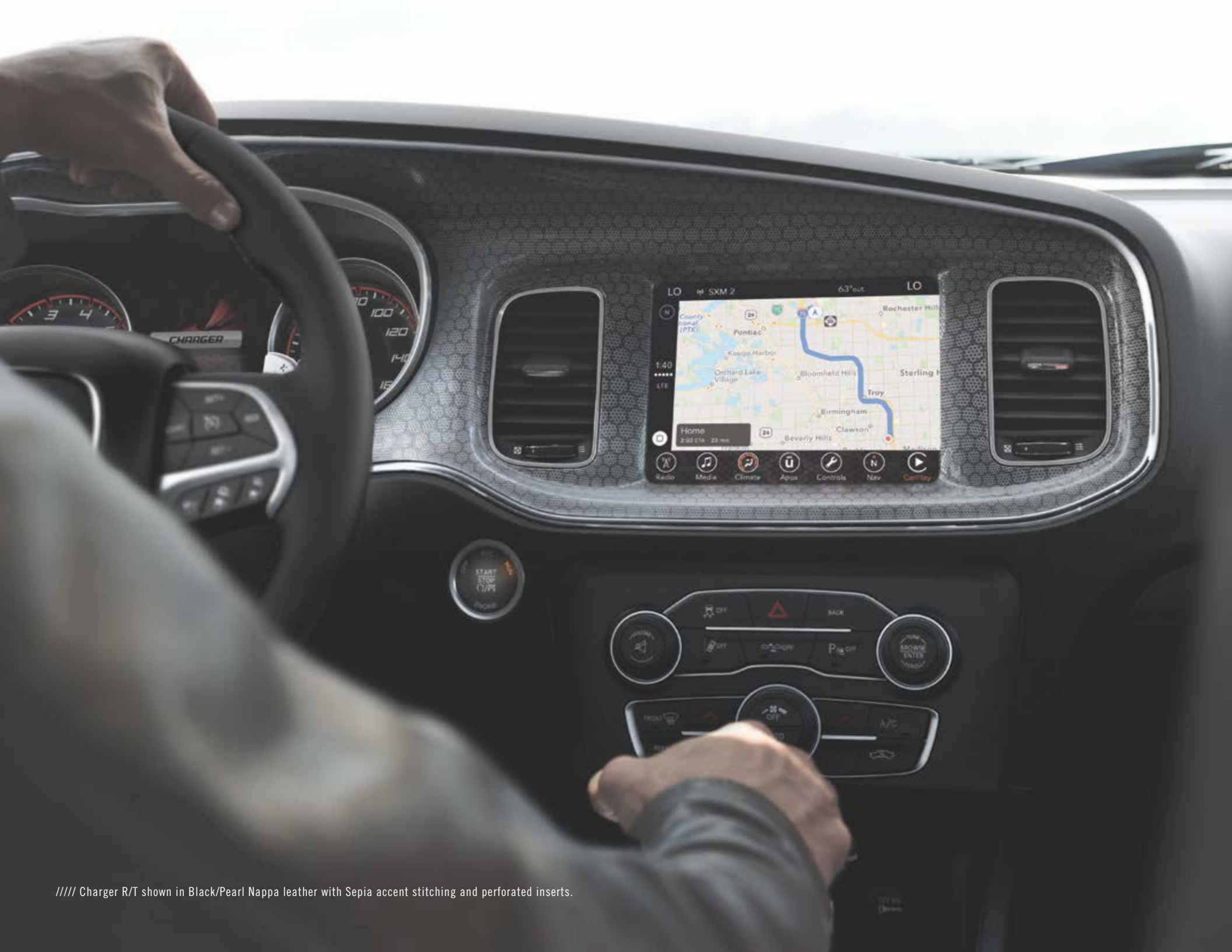
////// Charger R/T shown in Black/Pearl Nappa leather with Sepia accent stitching and perforated inserts.