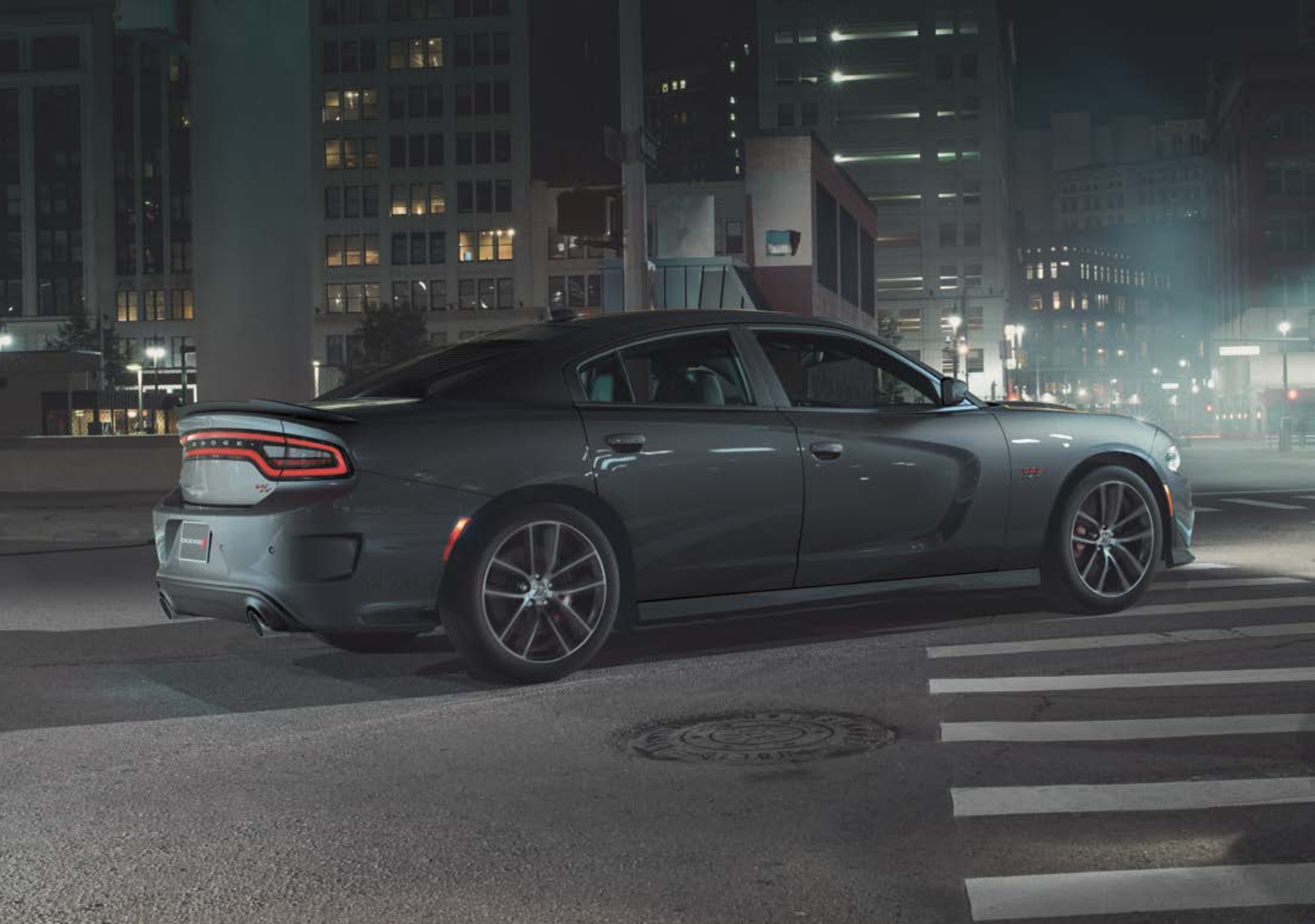
////// Charger R/T Scat Pack shown in Granite.